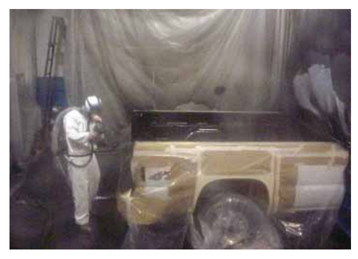
Spraying base coat with protective equipment.

For additional information, see NIOSH Alert: Prevent ing Asthma and Death from MDI Exposure During Spray-on Truck Bed Liner and Related Applications [DHHS (NIOSH) Publication No. 2006–149]. Single copies of the Alert are available from the following: