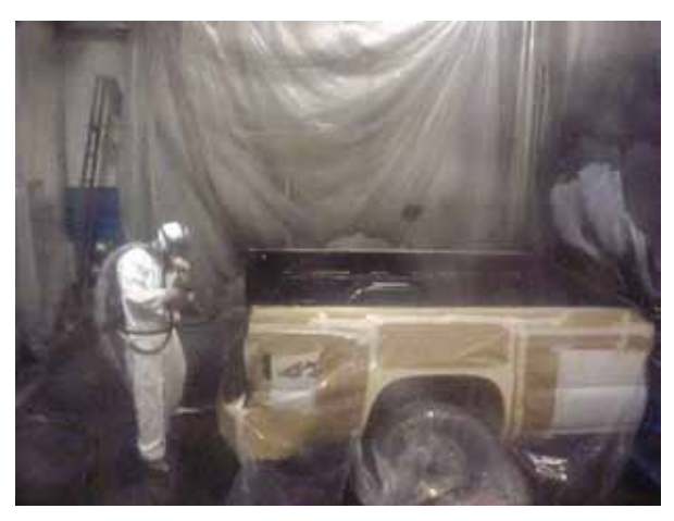
Figure 1. Spraying base coat with protective equipment.

NIOSH identified two spray-on processes commonly found in the industry [Heitbrink and Almaguer 2003]: one process applies truck bed liners at room temperature and