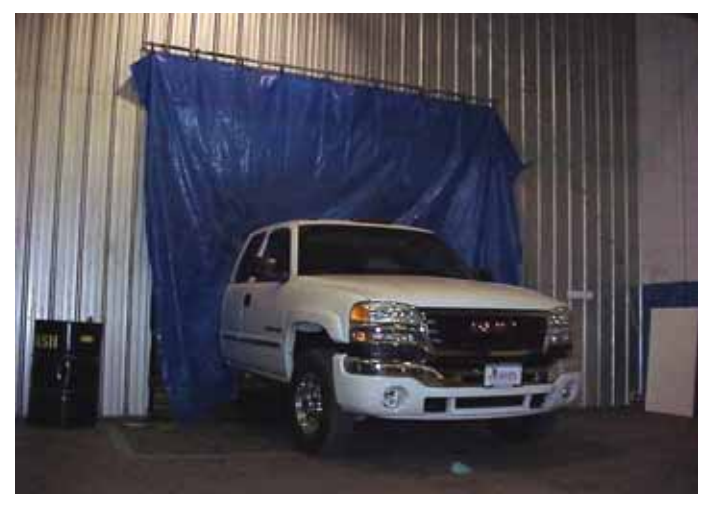
Truck in bed liner spray enclosure.

For additional information, see NIOSH Alert: Prevent ing Asthma and Death from MDI Exposure During Spray-on Truck Bed Liner and Related Applications [DHHS (NIOSH) Publication No. 2006–149]. Single copies of the Alert are available from the following: