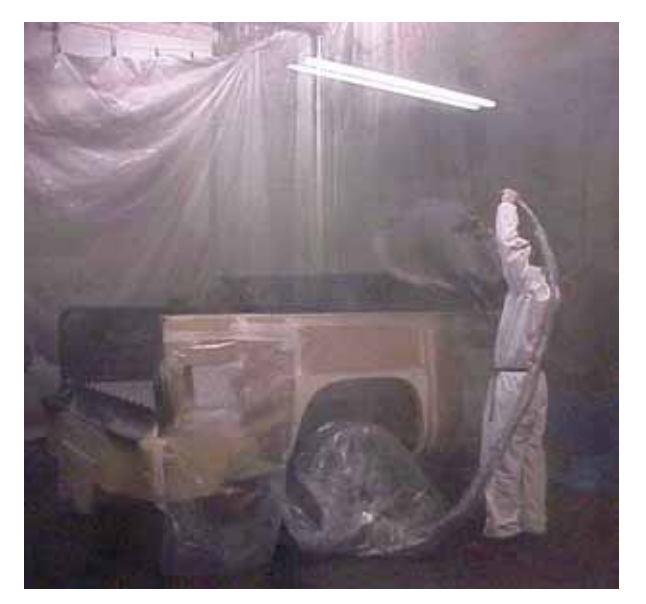
Figure 2. Spraying texturizing coat with protective equipment.

generally mixed in small quantities (quarts or gallons) at room temperature with a high-speed drill. Afterwards, the mixture is poured into a hopper gun and applied at 30–60 pounds per square inch from inside the truck bed. The chemicals used in the cold-batch operations typically contain less MDI (less than 20%). However, the coldbatch materials contain higher amounts of flammable solvents (toluene and N-butyl acetate) which should have their own exposure prevention and ventilation requirements. Cold-batch systems are popular because of the lower startup costs [Krupinski 2005].