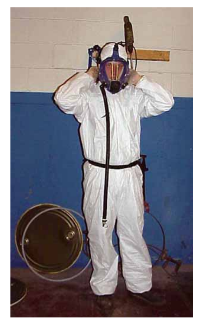
Figure 3. Worker wearing protective clothing and equipment.

When spraying MDI-based products or during entry immediately after spraying, wear